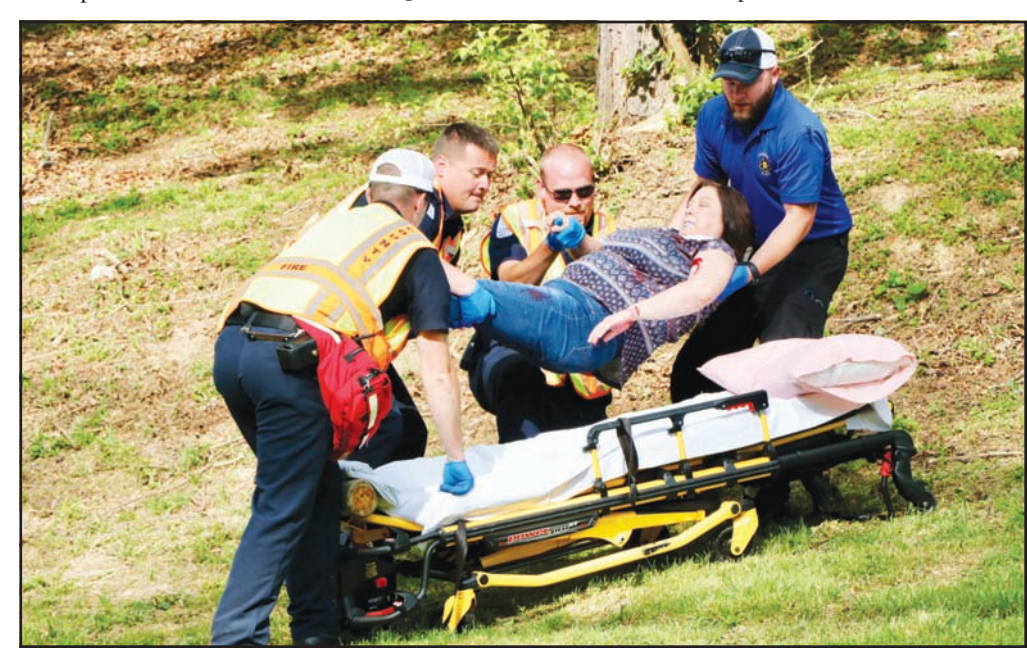
The all-agency active shooter training featured simulated wounds on people role-playing in the situation.

And that was exactly to identify and address first the point of the whole affair: responder vulnerabilities.